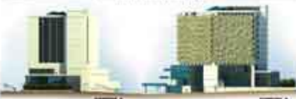
AD _ VII