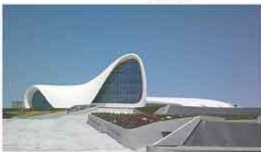
HYDER ALIEV MUSEUM

SHE WAS DESCRIBED BY THE GUARDIAN AS THE "QUEEN OF THE CURVE", WHO "LIBERATED ARCHITECTURAL GEOMETRY, GIVING IT A WHOLE NEW EXPRESSIVE IDENTITY".