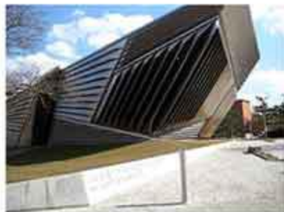
ROMO'S MANNI MUSEUM