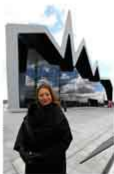
ZAHA HADID PRITZKER PRIZE WINNER

DAME ZAHA MOHAMMAD HADID (31 OCTOBER 1950 – 31 MARCH 2016) WAS BORN IN BAGHDAD, IRAQ. HADID WAS AN IRAQI-BRITISH ARCHITECT, ARTIST AND DESIGNER, RECOGNISED AS A MAJOR FIGURE IN ARCHITECTURE OF THE LATE-20TH AND EARLY-21ST CENTURIES. HADID STUDIED MATHEMATICS AS AN UNDERGRADUATE AND THEN ENROLLED AT THE ARCHITECTURAL ASSOCIATION SCHOOL OF ARCHITECTURE IN 1972. IN SEARCH OF AN ALTERNATIVE SYSTEM TO TRADITIONAL ARCHITECTURAL DRAWING, AND INFLUENCED BY SUPREMATISM AND THE RUSSIAN AVANT-GARDE, HADID ADOPTED PAINTING AS A DESIGN TOOL AND ABSTRACTION AS AN INVESTIGATIVE PRINCIPLE TO "REINVESTIGATE THE ABORTED AND UNTESTED EXPERIMENTS OF MODERNISM TO UNVEIL NEW FIELDS OF BUILDING.